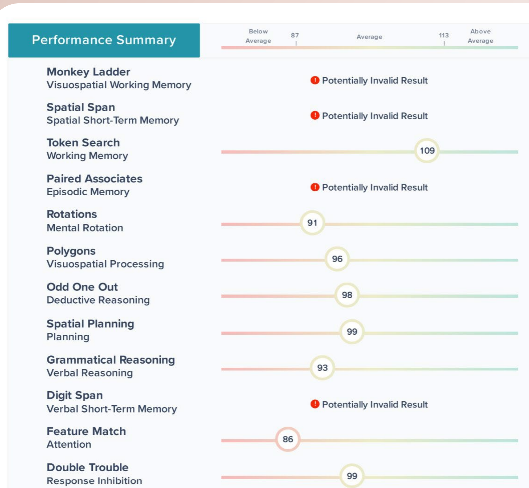
Figure 2: Neuropsychological Assessment results for Participant